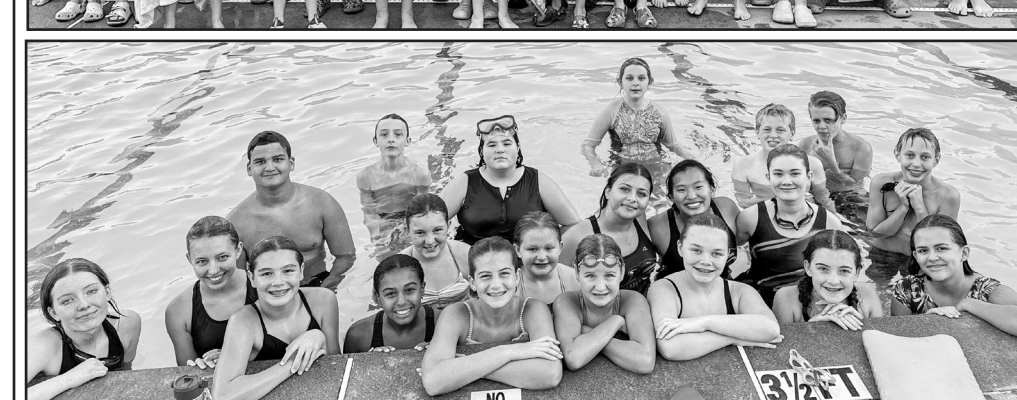
The UCHS and UCMS Panther Swim Team would like to extend a special thank you to the participants of the swim technique clinic held last week at the Meeks Park Pool. This clinic would not have been possible without the assistance from the Union County Recreation Department. A great time was had by all.