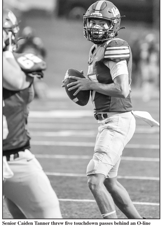
that gave him 'all day' to find an open man.