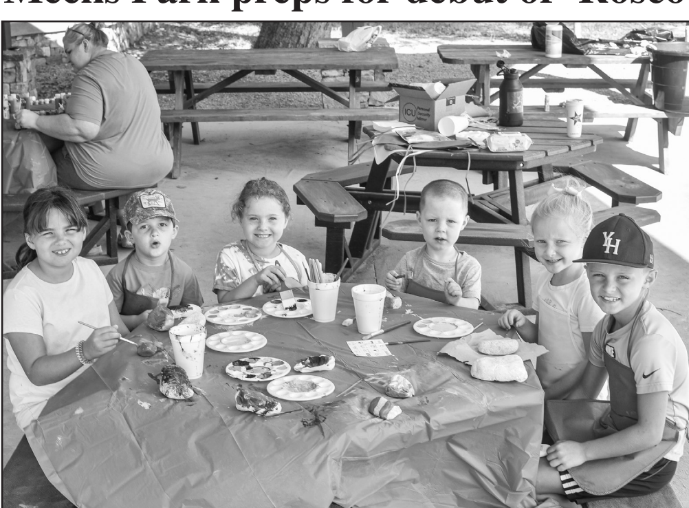
On Saturday, Sept. 2, local youngsters and their parents gathered at Meeks Park's Pavillion #3 to paint rocks that will eventually form the park's new pet, "Rosco the Snake." When completed, each rock will form a segment of Rosco, who will be located near the creek below the Bryant and Rich fields. Once Rosco debuts at Meeks Park, the public is welcome help him grow by adding their own painted rock to the display.