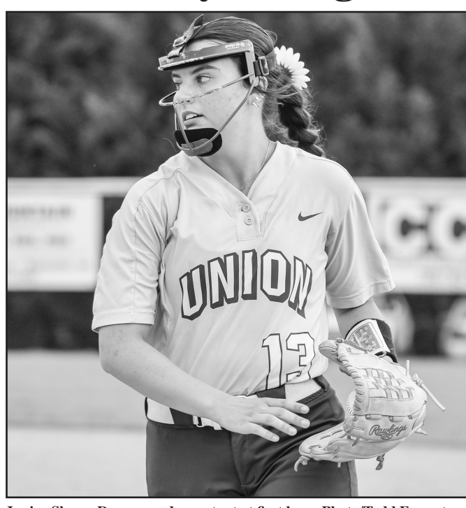
Junior Sloane Dyer records a putout at first base.

Union County stranded two in the third, but following her leadoff double, Peyton Grisham came around on a wild pitch with two away in